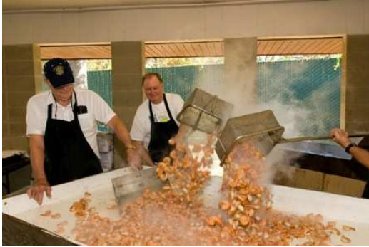
Photo Ops of Shrimporee Activities 2008